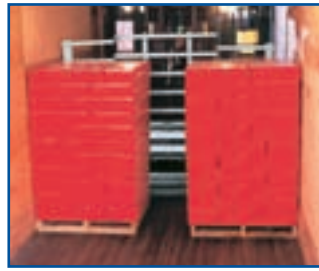
Spread loads against the inside trailer walls.