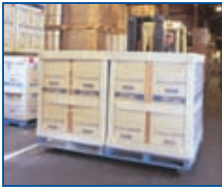
Close loads together for better transport stability.