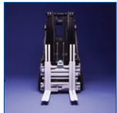
Close the forks to carry one pallet.