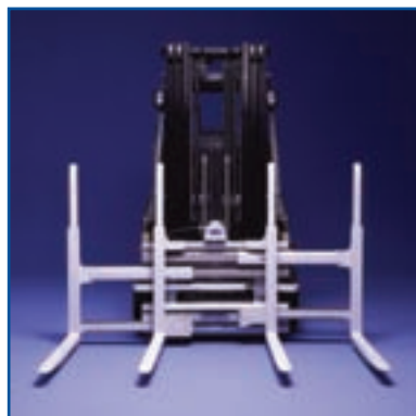
Spread the forks to carry two pallets.