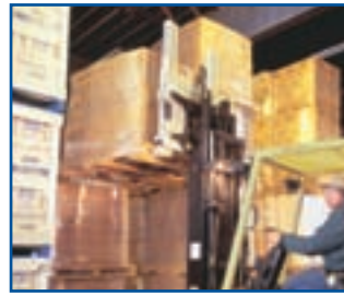
Narrow frame allows same maneuverability as a single-load truck.