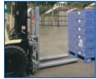
Picking a single pallet load.